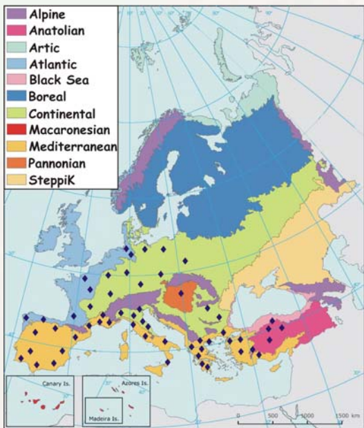
Figure 3. Biogeographical European regions and location of bee pollen samples.